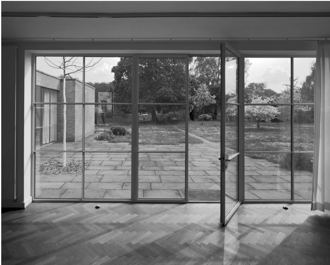
Press photo: Mies van der Rohe Haus, 2013, © Harf Zimmermann